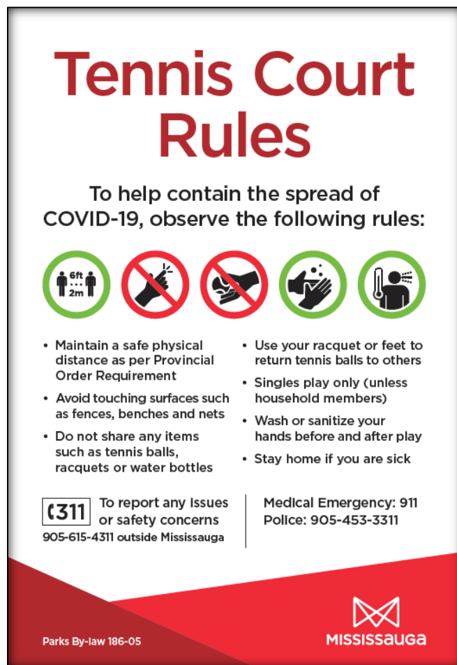
Figure 1-Sample 2020 By-law Sign

https://www.mississauga.ca/city-of-mississauga-news/covid-19-recovery/current-measures-and-restrictions/